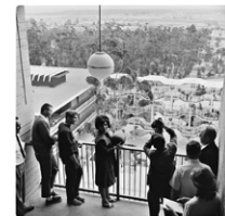
UCSD's first watermelon drop

examining plans for the new La Jolla Playhouse. Also included are images from the tumultuous '60s, when controversial philosopher Herbert Marcuse was on the UCSD faculty, and activist Angela Davis was a graduate student. Click here to read more.