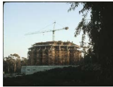
Geisel Library under construction

An exhibit of materials from the UCSD Archives highlighting milestones in UCSD's 50-year history are on display from October 13, 2010 through January 30,