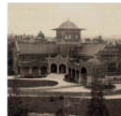
A.K. Smiley Public Library