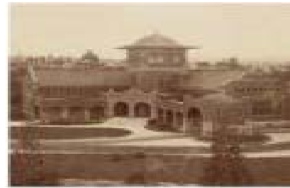
A.K. Smiley Public Library

The tour includes an all-day excursion to the A.K. Smiley Public Library in Redlands and UC Riverside's Special Collections and Archives, housed in the university's Rivera Library. We will stop to lunch at the iconic Mission Inn, a National Historic Landmark and the crown jewel of the Inland Empire, where we will have some free time to explore this fascinating property.