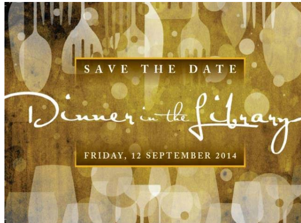
Dinner in the Library