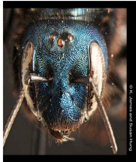
Osmia gabrielis (Mason Bee): This large, beautiful species tends to have a deep blueish hue on its head and a brilliant dark purple on its abdomen