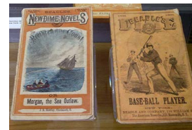
Dime Store Novels

In her 1832 book, Domestic Manners of the Americans , English novelist and travel writer Frances Trollope caustically opined of America that "it's the impression of many that the country is largely unlettered and unread. The immense exhalation of periodical trash which permeates to every cot and corner of the country," she wrote, "is unquestionably one great cause of its inferiority."