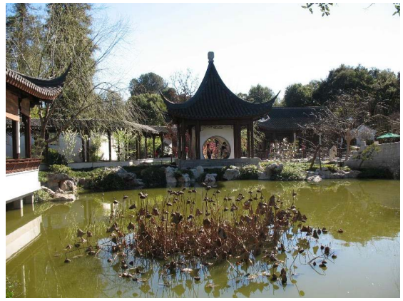
The Chinese Garden at the Huntington