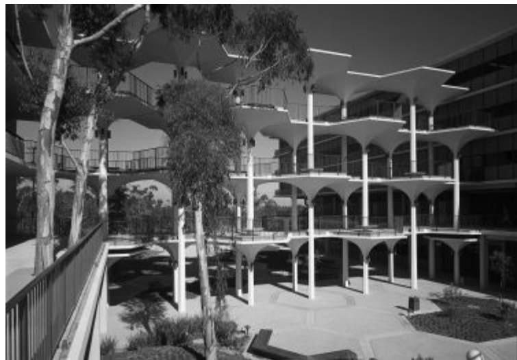
Breezeway between Bonner and Mayer Hall

An exhibit of rarely seen photographs of the UCSD campus by famed photographer Ansel Adams, has been organized and put on display by the Mandeville Special Collections Library. The photographs, which depict UCSD in its infancy, were taken in the early 1960s, when Adams was commissioned by the University of California to photograph each UC campus. A selection of the photographs was published in Fiat Lux in 1967, as one of the centennial publications prepared by the University.